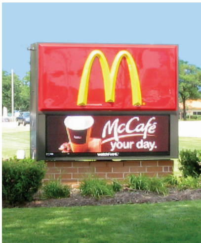
19mm Color Aurora, Ill. Matrix: 32 x 112 29" H x 7'3" L

In addition to the McDonald's-approved custom artwork, Watchfire also provides over 1,200 additional pieces of content (EasyArt) in both animated and still format to help further promote your business. We include this collection in our user-friendly Ignite Graphics Software package.