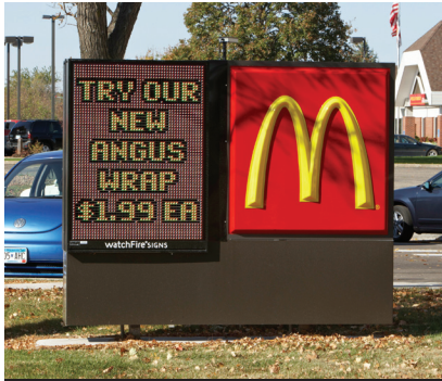
19mm Color Hastings, Minn. Matrix: 64 x 48 4'5" H x 39" L